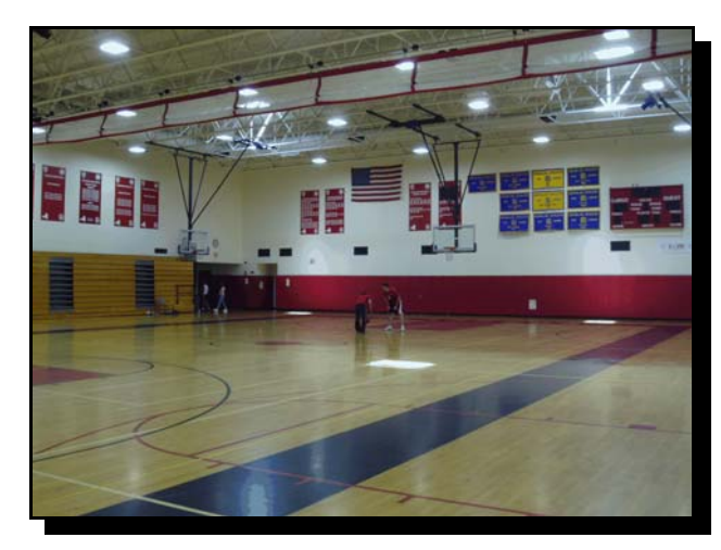
New Gymnasium Complex