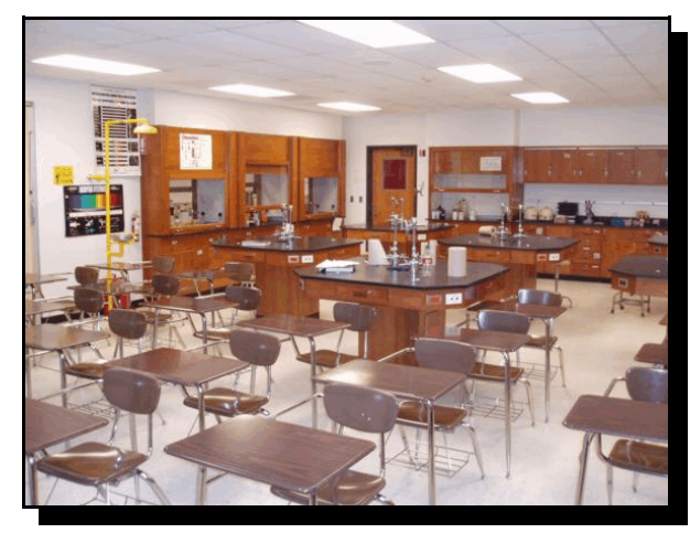
New Science Laboratory